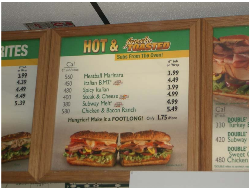
Figure 1. Subway Menu Boards in Manhattan on July 2, 2007

Chain FSEs represent an appropriate focus for regulation for three reasons. First, restaurant chains use highly standardized menu items and can readily measure or estimate accurate calorie counts. Second, these major chains represent a substantial and disproportionate share of restaurant meals. While restaurant chains make up approximately 10% of NYC's 23,000 restaurants, they account for a much larger proportion of restaurant meals than suggested by their number (i.e., far more than 10% of meals). 74 Data from The NPD Group, a major market research company, indicate that, in 2007, major chain restaurants in the NYC metropolitan area accounted for more than one third of all restaurant traffic – 34.7% 75 – more than 3-fold their representation among food service establishments overall. In fact, we estimate that this regulation has the potential to affect consumer choices involving at least 145 million meals in New York City per year, and possibly as many as 500 million or more. 76 And third, as outlined above, chain restaurants typically serve food that is clearly and disproportionately associated with obesity.